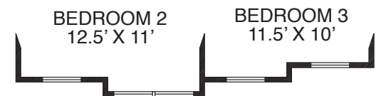
SECOND FLOOR W/ B-1 & B-2